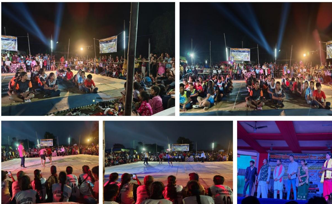
National Level Women Kabaddi and Freestyle Women Wrestling Championship held on 11-13 October, 2024 at Bhatgama, Madhepura, Bihar