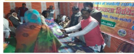
Camp Location - Bhadohi