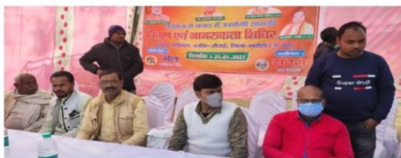
Camp Location - Kiolara, Auraia, Bhadohi