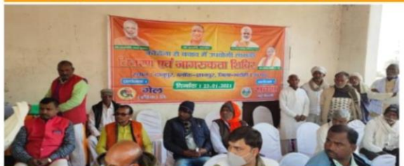
Camp Location - Danpur, Gyanpur, Bhadohi