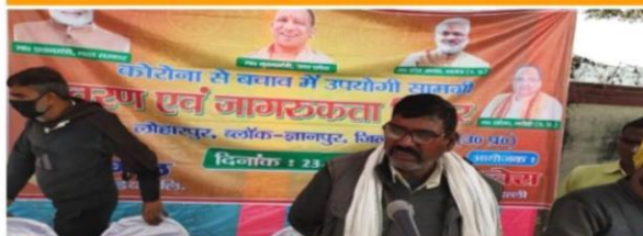
Camp Location - Loharpur, Gyanpur, Bhadohi