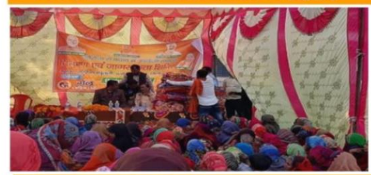
Camp Location - Sari Rajputani , Gyanpur,