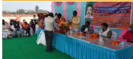
Camp Location - Lohrakhas, Gopiganj,