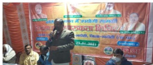
Camp Location - Gangarampur, Bhadohi