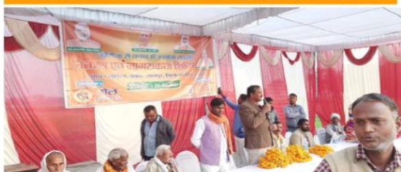
Camp Location - Bhushaulla , Gyanpur, Bhadohi